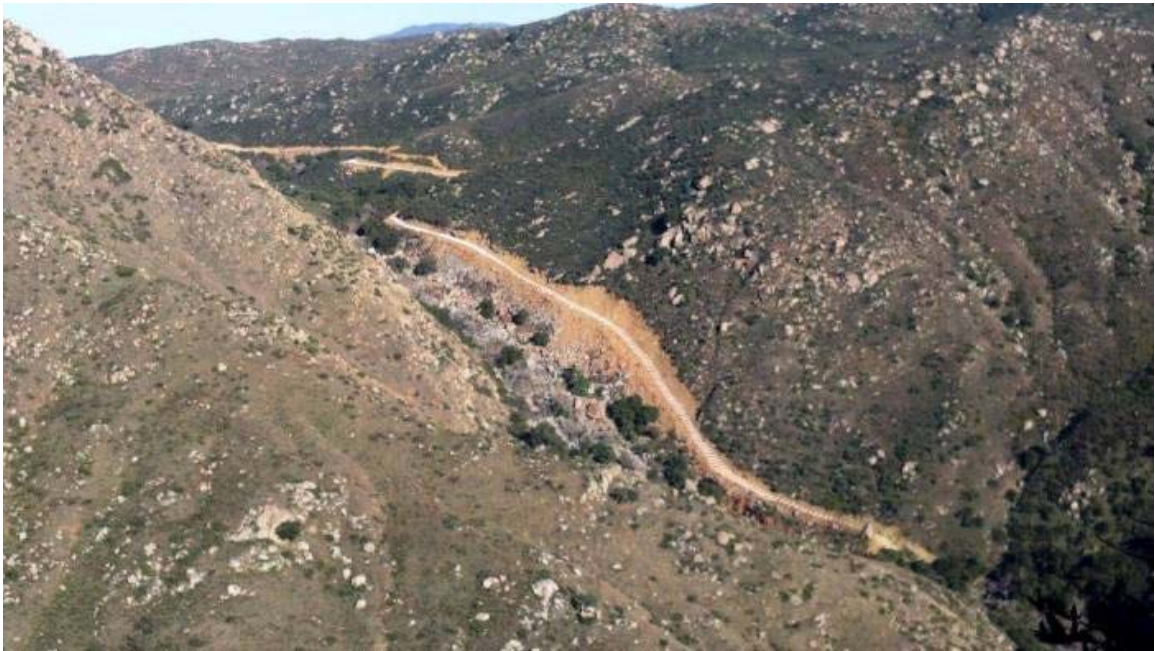
Above: after road construction; Below: pre-road construction