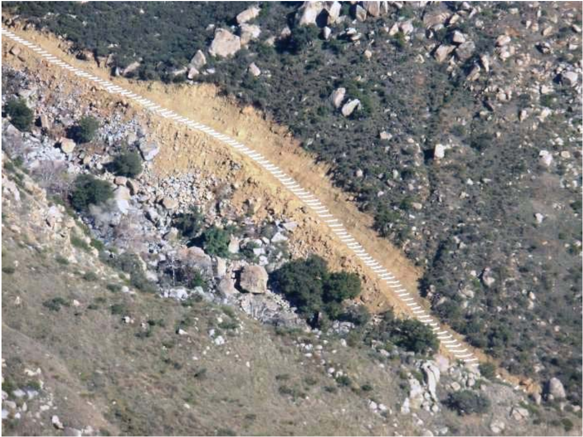
Above: close-up of road construction